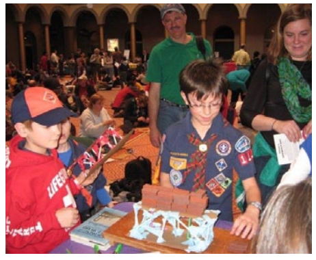
Based on load-testing, this scout has a bright future!