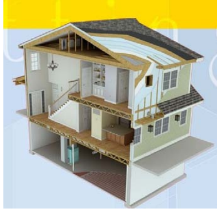
The NIST Net Zero Energy Residential Test Facility.

We will need to provide names to NIST of the expected attendees at least 1 week prior to the tour . If you are not a U.S. Citizen or Permanent Resident (with a green card), we will need to