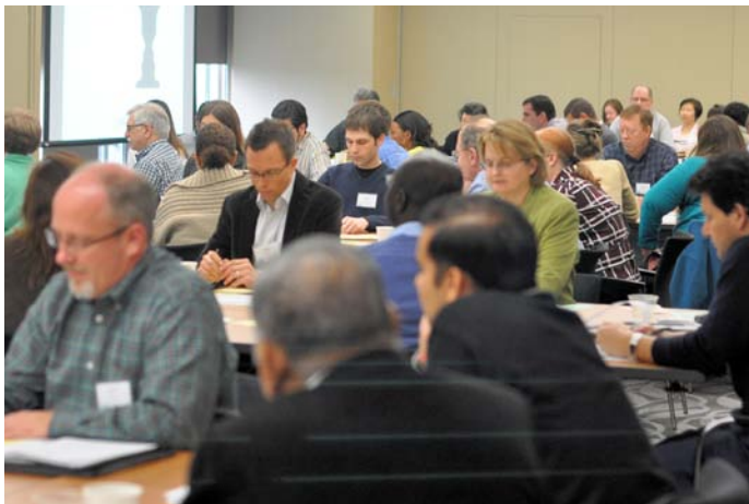
Attendees at the March 2012 Professional Development Seminar.