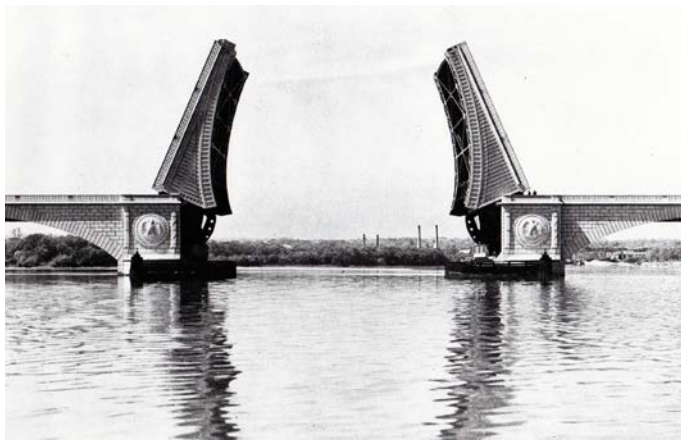
The AMB opens wide.