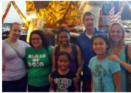
Participants from the Scavenger Hunt meet at the National Air & Space Museum

Participants arrived around noon and set off on the scavenger hunt around 12:45 p.m. The teams split up in search of the answers and ventured into such