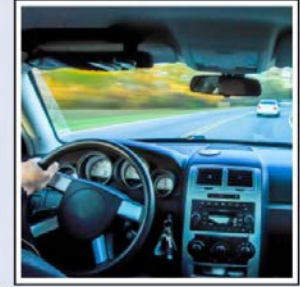
Audiobooks quicken the pace of great idea exploration.

technology to quicken your pace for exploring ideas that build great companies.